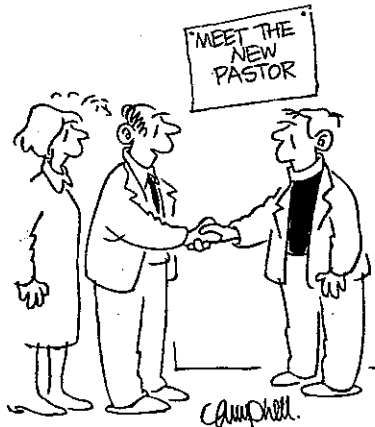
"You'll love the congregation. We're just chock-full of sermon material."